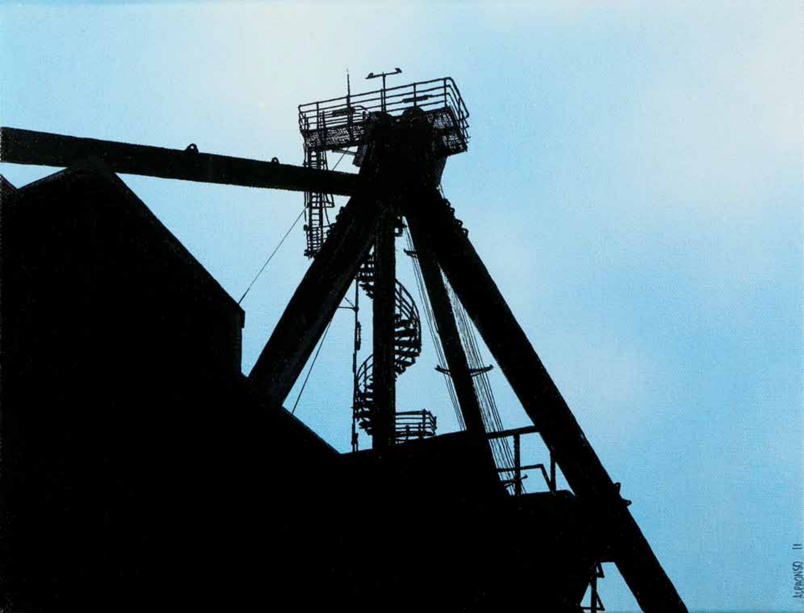
Janus Alphonso "Blue Cranes IV" Mixed technique on canvas 30 x 40 cm 2014