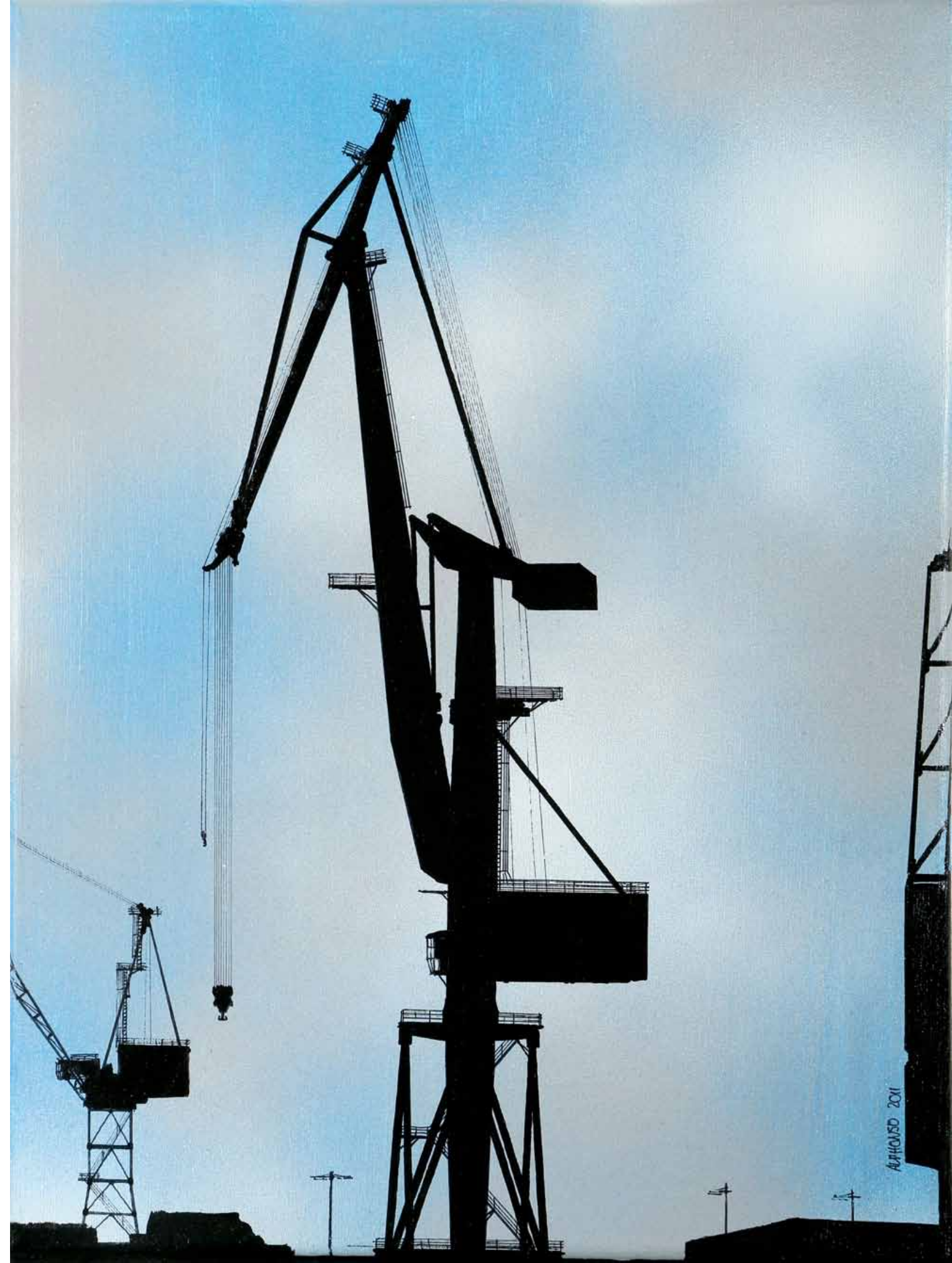
Janus Alphonso "Blue Cranes III" Mixed technique on canvas 30 x 40 cm 2014