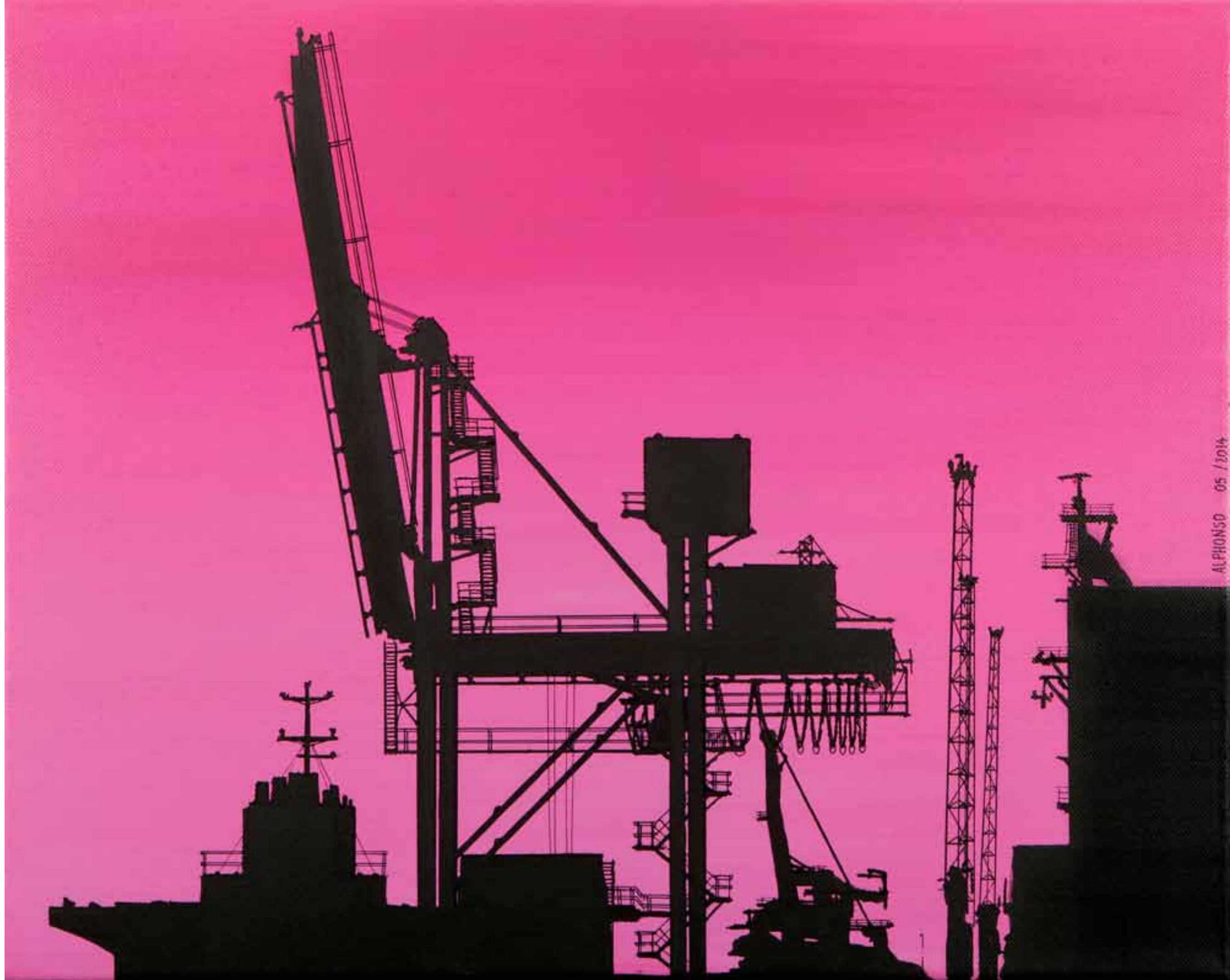
Janus Alphonso "Pink Cranes" Mixed technique on canvas 50 x 40 cm 2014