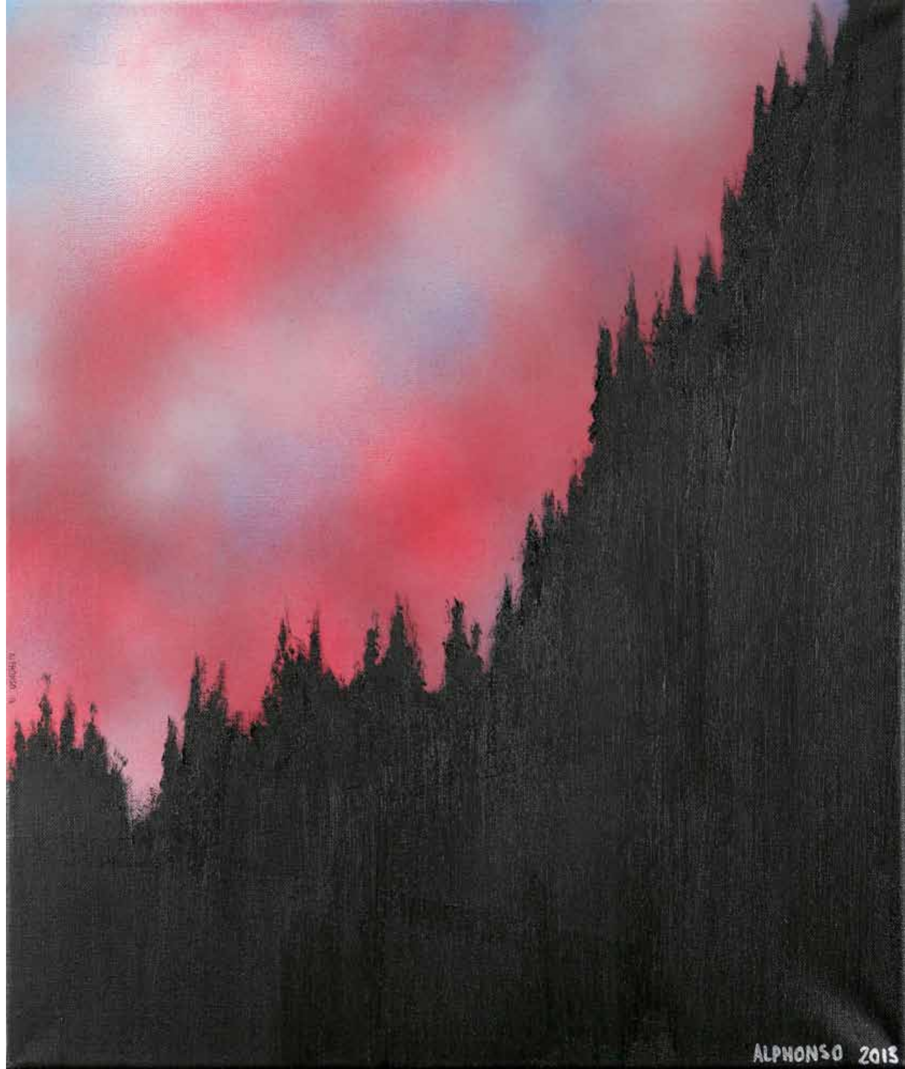
Janus Alphonso "Landscape II" Mixed technique on canvas 60 x 50 cm 2013