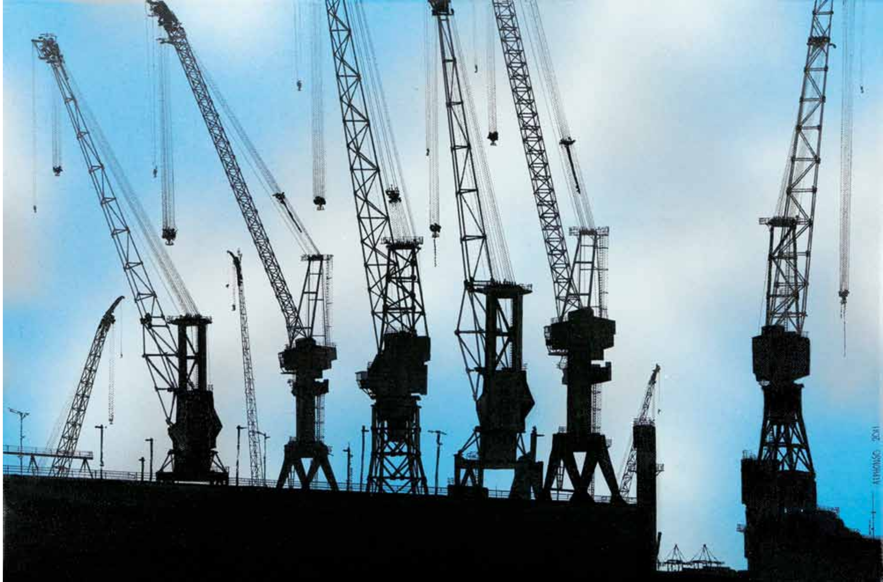
Janus Alphonso "Blue Cranes I" Mixed technique on canvas 60 x 40 cm 2013