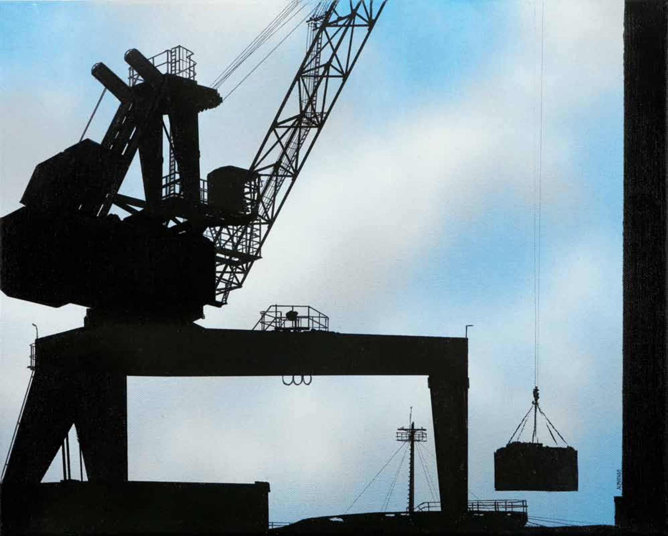
Janus Alphonso "Blue Cranes II" Mixed technique on canvas 50 x 40 cm 2013