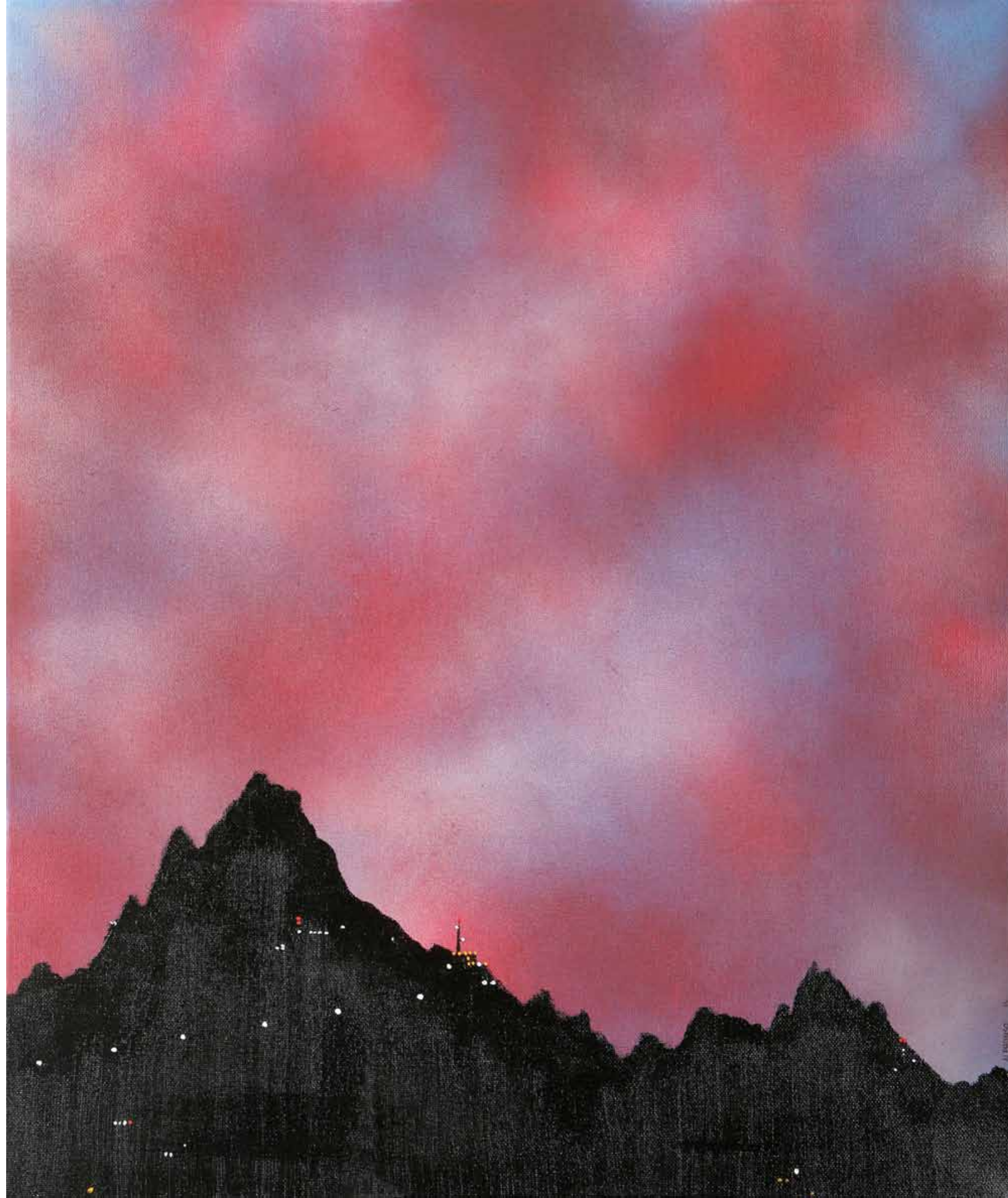
Janus Alphonso "Landscape I" Mixed technique on canvas 60 x 50 cm 2013